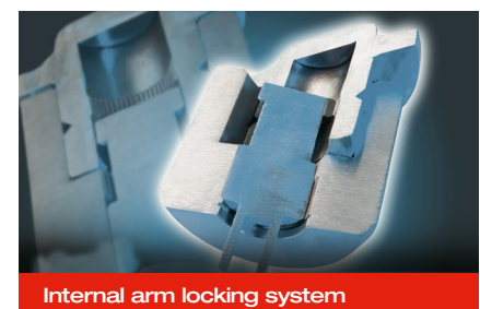
Internal arm locking system