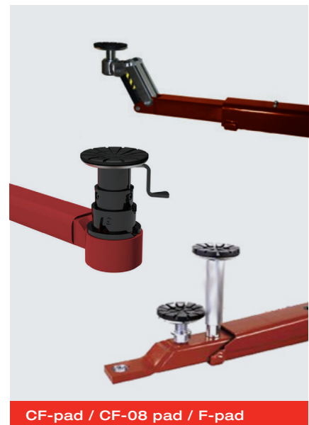
CF-pad / CF-08 pad / F-pad