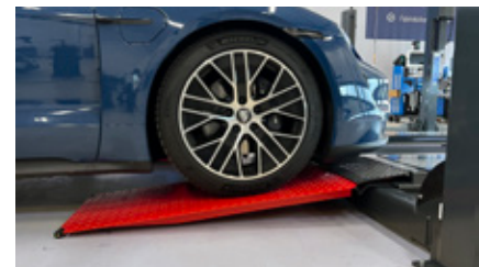
Long ramps available for low vehicles (optional)