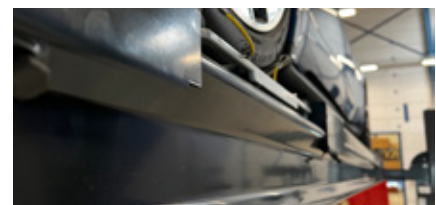
Bended profile for high platform stability